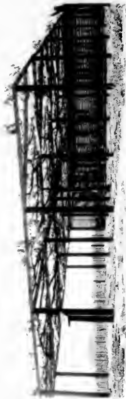
The Winkler Vine, April 15, 1971